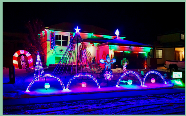
9988 Everglades - DRC 1 Winner