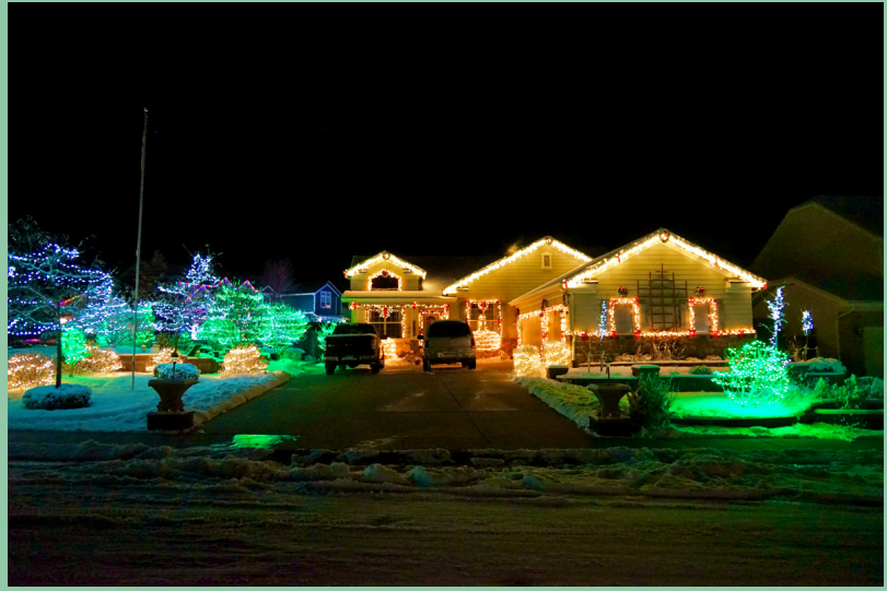
10204 Ross Lake - Grand Prize Winner

Twas the night before the new year! As we start 2024 off with a bang, let's remember our beautiful homes which were decorated so nicely for the holiday season! Congratulations!