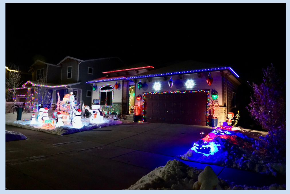
10125 Golf Crest - 1st Place Winner