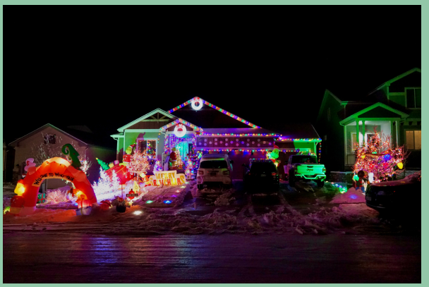
13485 Park Meadows - DRC 2 Winner

Winter is upon us, so remember the trees and shrubs, as they are thirsty! Winter watering was showcased as an article in the November newsletter by the Metro District Manager. The DRC is also reminding residents to water when the temperature maintains at 40 degrees and above. The watering will help the shrubs and trees to survive the dry winters.