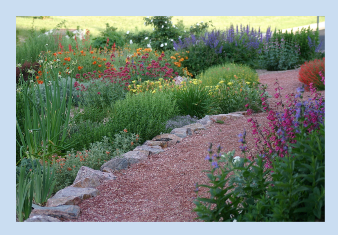
Jim Nikkel, General Manager Meridian Service Metropolitan District - Water, Sewer, Drainage, Parks, Recreation www.meridianranchmetro.org

Almost half of the water we use at home is used to maintain the landscape. The problem is that while we live in Colorado, we have traditionally landscaped with plants that are native to regions with much higher annual precipitation. To successfully grow these plants, we must supplement the natural precipitation with our limited surface and groundwater. The use of plants with high water demands is not our only landscaping option; fortunately, neither is removing plants from the landscape. The concept of Xeriscape was developed in Denver, Colorado, in response to water shortages in the 1980's. Xeriscape refers to a landscape that uses little supplemental water. It does not refer to dry, barren landscape, nor is a Xeriscape a "no maintenance" landscape. By using plants that are well adapted, mulches that suppress weeds and conserve water, and efficient irrigation systems to make the most use of water, these landscapes can have color and fragrance with only monthly or seasonal gardening chores.